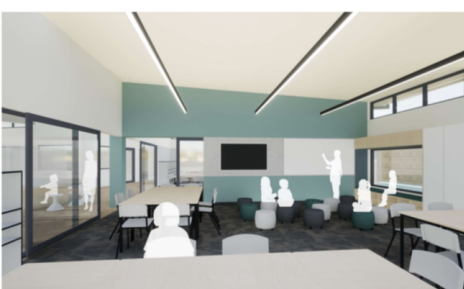
HOLY EUCHARIST PRIMARY SCHOOL - STAGE 1 INTERNAL PERSPECTIVE - GFLA B 070