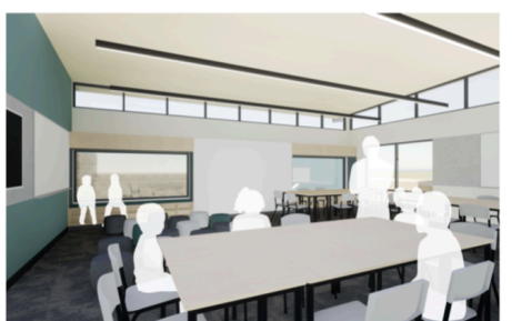
HOLY EUCHARIST PRIMARY SCHOOL - STAGE 1 INTERNAL PERSPECTIVE - GFLA B 080