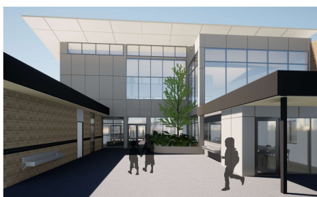
HOLY EUCHARIST PRIMARY SCHOOL - STAGE 1 SOUTH VIEW - BASE SCHEME

Last year, the building committee and I we met with MINX architects to finalise our plans for our new building. Our new building will be two-storey and will be attached to the MacKillop Learning Centre (MLC). The building will include 8 new classrooms and a learning deck on the first floor. However, the inclusion of the learning deck will depend on the cost of the overall building. This week the plans were submitted to Brimbank council for approval. The estimated cost for the new classrooms will be around $4.1M. We were successful in obtaining $2M from the Schools Capital Grant. This money, together with a contribution from our school (as well as the loan), will be put towards a new building. If the plans are approved the build should commence in the middle of this year.