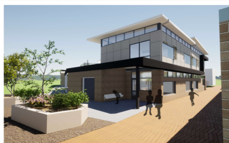
HOLY EUCHARIST PRIMARY SCHOOL - STAGE 1 SOUTH VIEW - BASE SCHEME