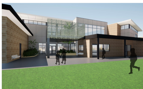
HOLY EUCHARIST PRIMARY SCHOOL - STAGE 1 SOUTH VIEW - TENDER OPTION 1