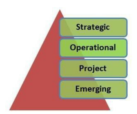
Figure 3: Risk process model