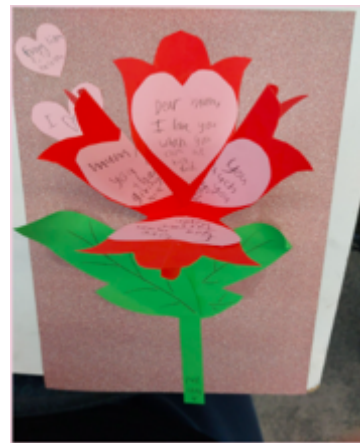
Buddy Activity 4SN & 2TN

Thank you to the companies below who generously donated to our Mother's Day Raffle this year. We are thankful for the generous gifts that included a pot plant from Toan Trinh Gardens (a family run business from our school), a motherly themed hamper from Westwood Legal, a family law specialist that services our local area and an $80 gift voucher from Tay Do Cafe Restaurant on Alfreda Street in St Albans (a family run business from our school as well).