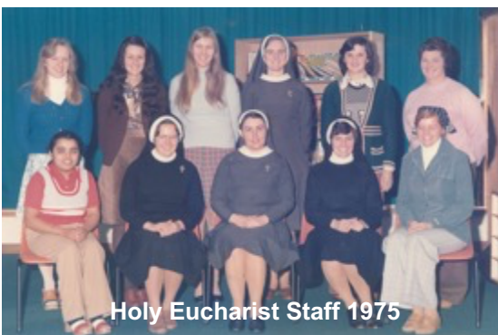
Holy Eucharist Staff 1975