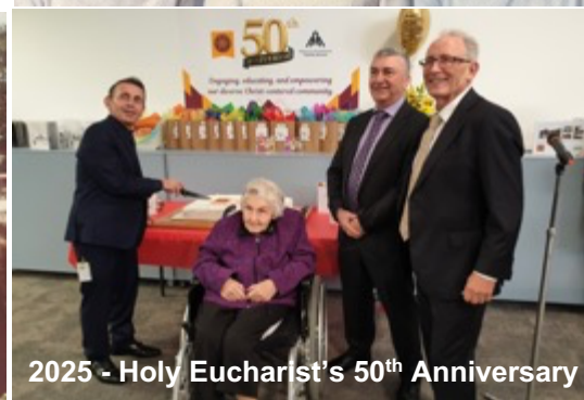
2025 - Holy Eucharist's 50 th Anniversary